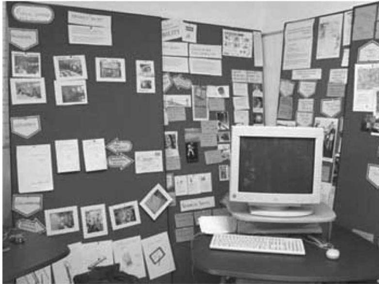
Figure 1 Corner of INCITE office