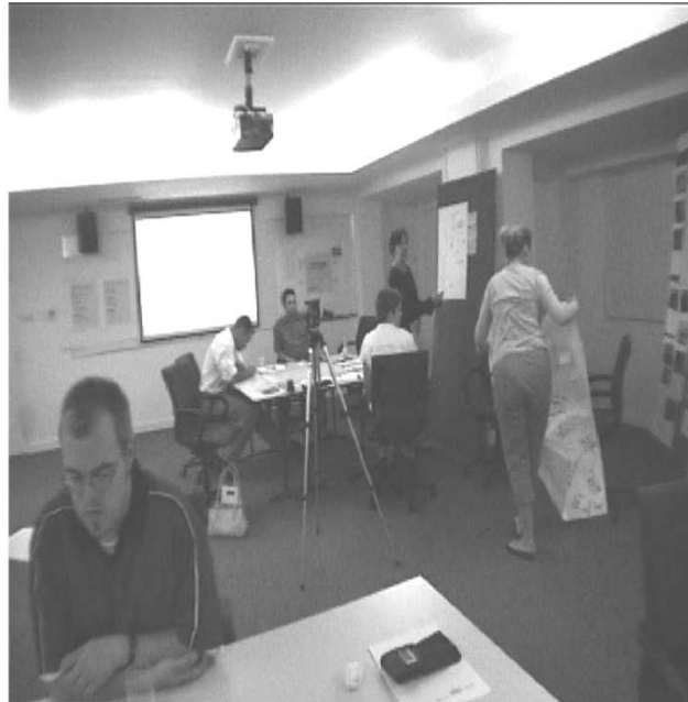
Figure 3 Workshop at Sapient