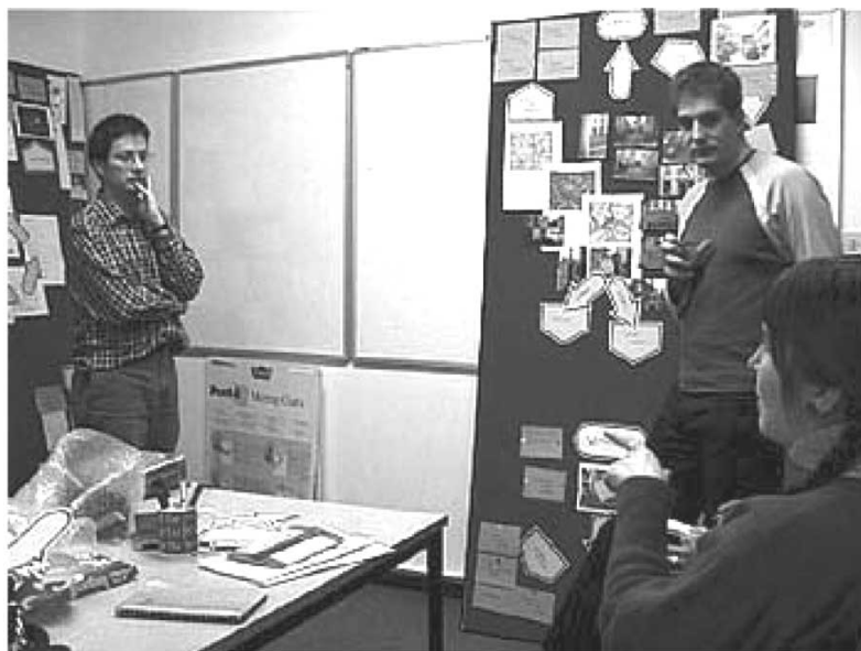
Figure 2 INCITE office in use